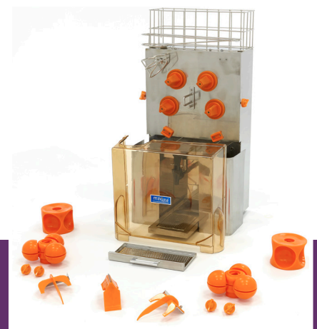
Easy to dismantle and clean