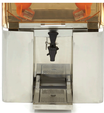
Stainless steel housing, with a maximum bottle / glass height of 16 cm