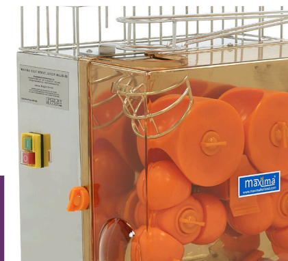
Anticorrosive press parts and on-off switch on the side